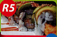
R5 Dragon Roll $12

California roll topped with hamachi scallion fish eggs (wasabi mayo)