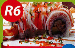
R6 Titanic Roll $12

Shrimp tempura roll topped eel & avocado (eel sauce)