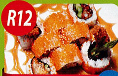
R12 Spider Roll $12

Salmon tuna white fish avocado scallion fish eggs with soy nori (spicy mayo)