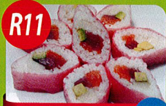
R11 Mayflower Roll $12

Spicy tuna roll topped with white fish & jalapenos (spicy mayo)