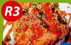
R3 Volcano Roll $12

California roll topped wlassorted fish & fish eggs