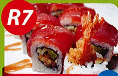
R7 Moonlight Roll $12

Shrimp tempura roll topped with crab meat scallion & fish eggs (eel sauce)