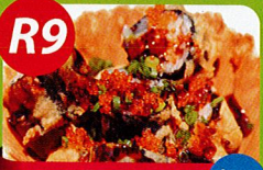
R9 Japan Roll $12

Shrimp tempura roll topped with salmon & mango (spicy mayo)