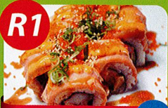
R1 Lion King $12

California roll topped backed salmon fish egg & scallion (eel sauce)