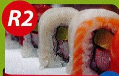
R2 Rainbow Roll $12

California roll topped backed salmon fish egg & scallion (eel sauce)