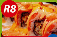
R8 Golden Salmon Roll $12

Shrimp tempura roll topped with crab meat tuna scallion (kimchee sauce)