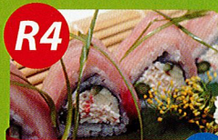
R4 Killer Hamachi Roll $12

California roll topped with spicy mixed fish cooked & scallion (eel sauce)