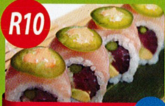
R10 Mixican Roll $12

Deep fried roll mix fish inside with scallion & fish eggs (eel sauce)